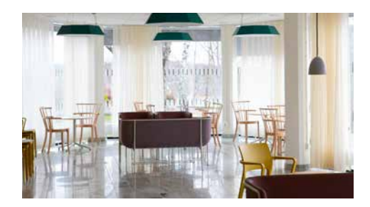
Interested in available properties? Contact your property manager or have a look at locum.se/lediga-lokaler.

Every healthcare property is managed by a local team comprising of several proffessional roles and spanning broad and deep expertise.